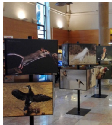
The Water Documentation Centre hosted the exhibition