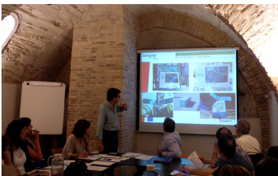
Members of the Biodiversity Commission discussed different projects

and presented their technical statement relating to the work developed in LIFE Zaragoza Natural.