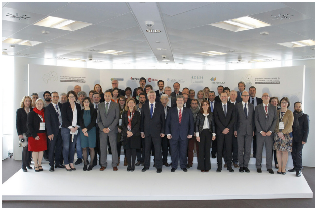
The participants at the 8th Conference on Sustainable Cities