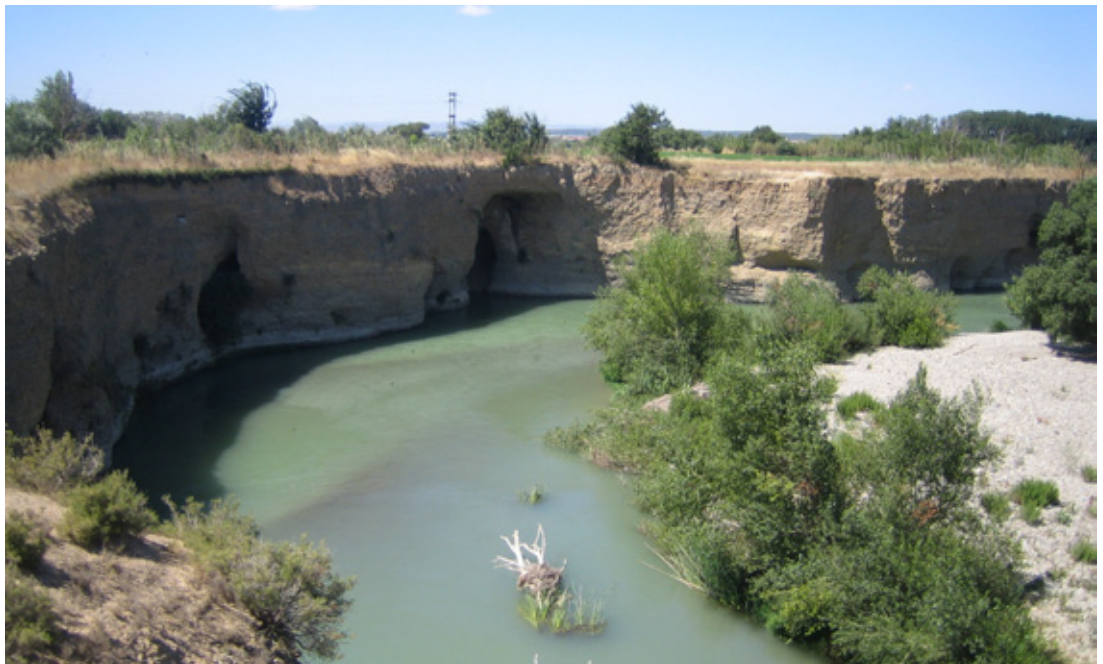
Peña del Cuervo