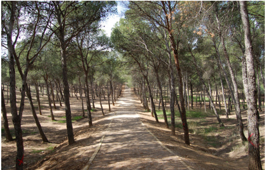
Monte de Torrero